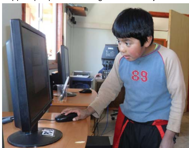
World Vision received desktops to support youth.