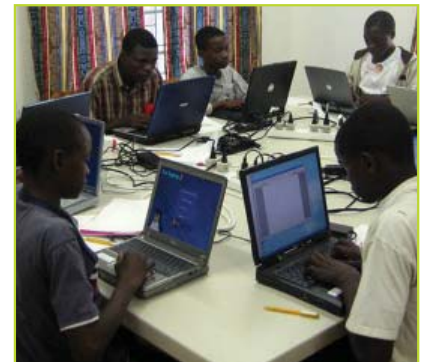
10 laptops to an NGO in Namibia