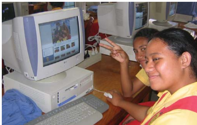
Peace Corps Volunteer in Western Samoa received 50 computers for youth programs.

InterConnection has provided over 25,000 computers to organizations in 40 countries. At least 250,000 people have benefited from refurbished computer equipment. In Seattle, over 4,000 low-income and unemployed people have received computer hardware training.