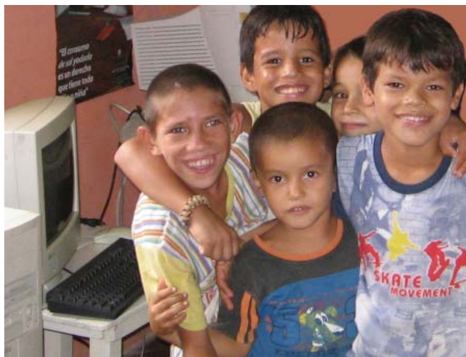
Youth in Paraguay received over 400 desktops.