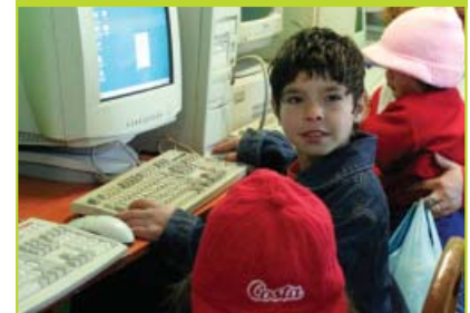
4,000 to schools in Chile