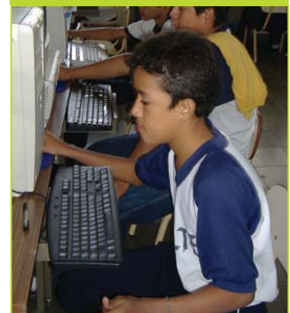
18 to an orphanage in El Salvador