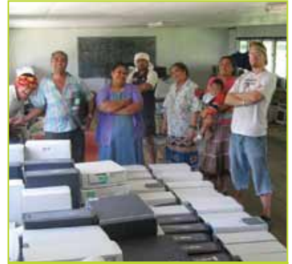
200 to a training center in Tonga