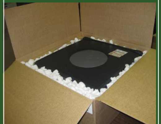
Boxed and padded computer