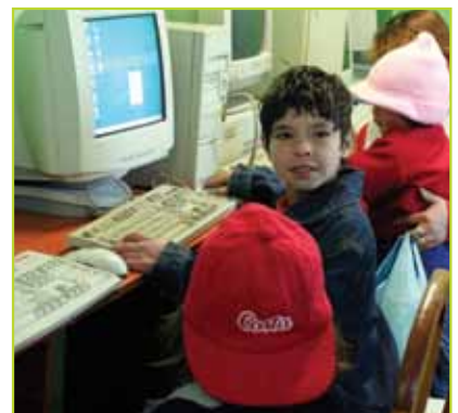
18 to an orphanage in El Salvador