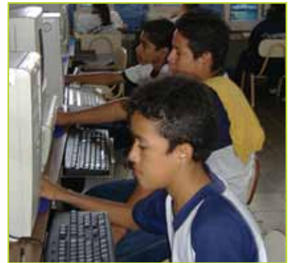
18 to an orphanage in El Salvador