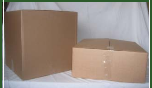
Boxed computer and monitor