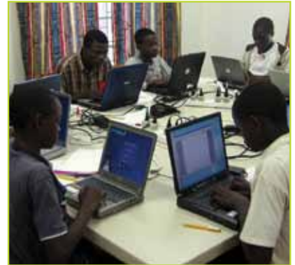
10 laptops to an NGO in Namibia