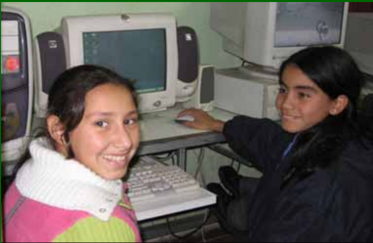
World Vision, Chile