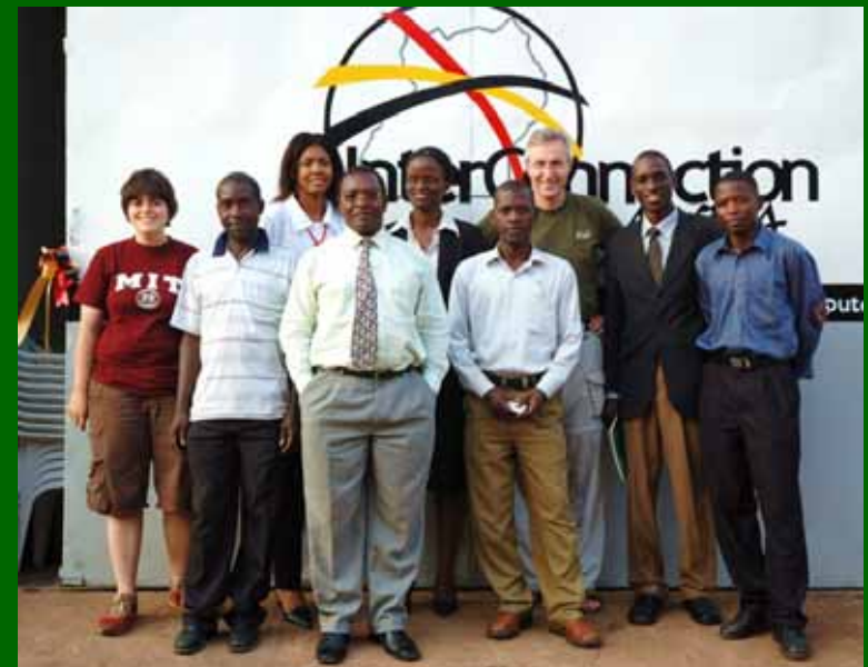
InterConnection Uganda Team

4,000 Computers to Schools in Chile 80 to New World Villages, Belize 420 to The Rotary Club of San Ignacio, Belize 210 to Makhoarane Primary School, South Africa 180 Computers and Monitors to Toledo Development Corporation 210 Fundación el Camino, Guatemala 420 Sefrioui-Badissy Foundation, Morocco 20 Connect Education, El Salvador 201 Computers for the World, Montevideo, Uruguay 25 World Vision, Zambia 160 for Fiji Schools 367 to Iraq Schools 100 to Setsembiso Sebunye High School, Swaziland 225 for Alter Vida, Paraguay 430 for Gujarat state in India 410 for Peace Corps Ecuador Shipment 230 for Presidency university in Bangladesh 225 for Save the Children of Tarime, Tanzania 250 for Proyecto Enlace Quiché in Guatemala